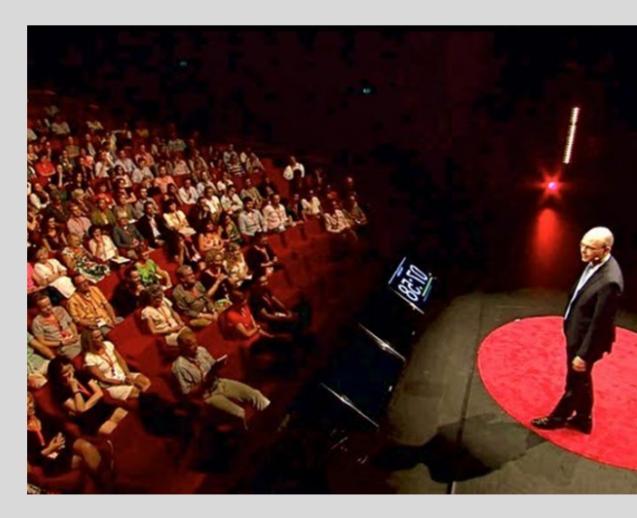
Link to Paul's TEDx talk about strategic quitting: https://www.youtube.com/watch?v=QLuqXctU_IQ